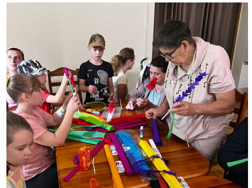
Project HOPE's mobile MHPSS unit conducts a group activity session at the Dallas Hotel, a refugee center, in Malopolske. Photo by Project HOPE staff, 2024.