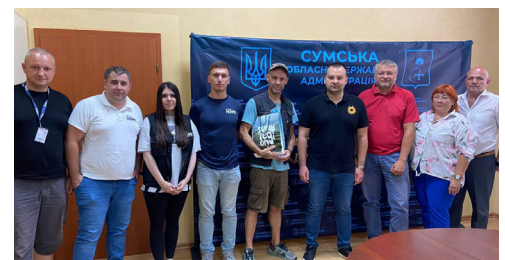
Members of Project HOPE's Ukraine team launch a new office in Sumy.

Project HOPE is a sub-award partner for the five-year USAID-funded Rehabilitation for Ukraine Activity (Rehab4U) program , which is focused on creating sustainable, quality physical rehabilitation services within the health system across all levels of care by addressing both urgent, short-term gaps and long-term system-level requirements.