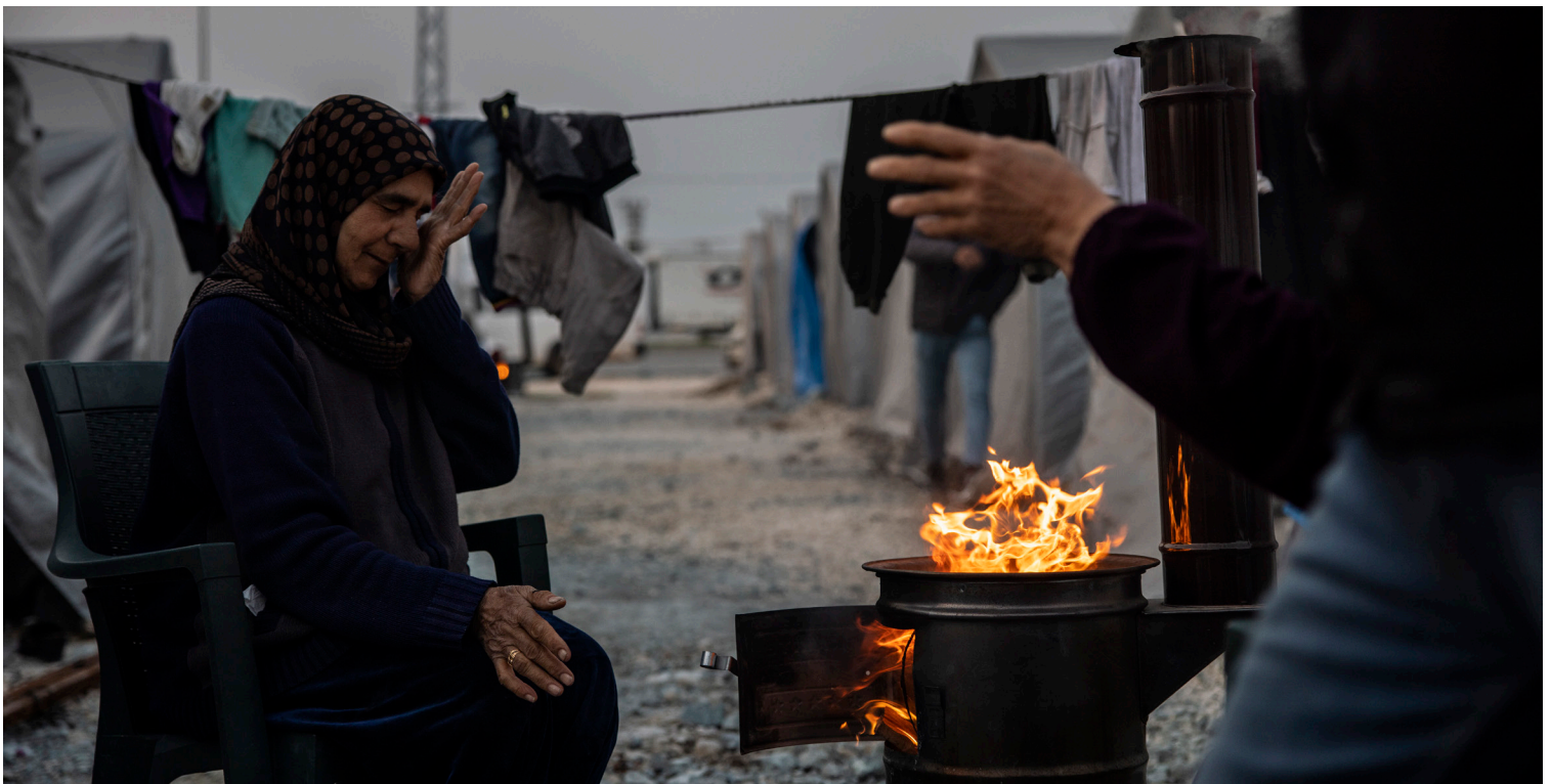
Syrian refugees light wood fires by night and burn plastic to stay warm in a camp in Hatay Province on Friday, March 3, 2023

None of the nine rural villages and cities included in the assessment currently had accessible MHPSS services for