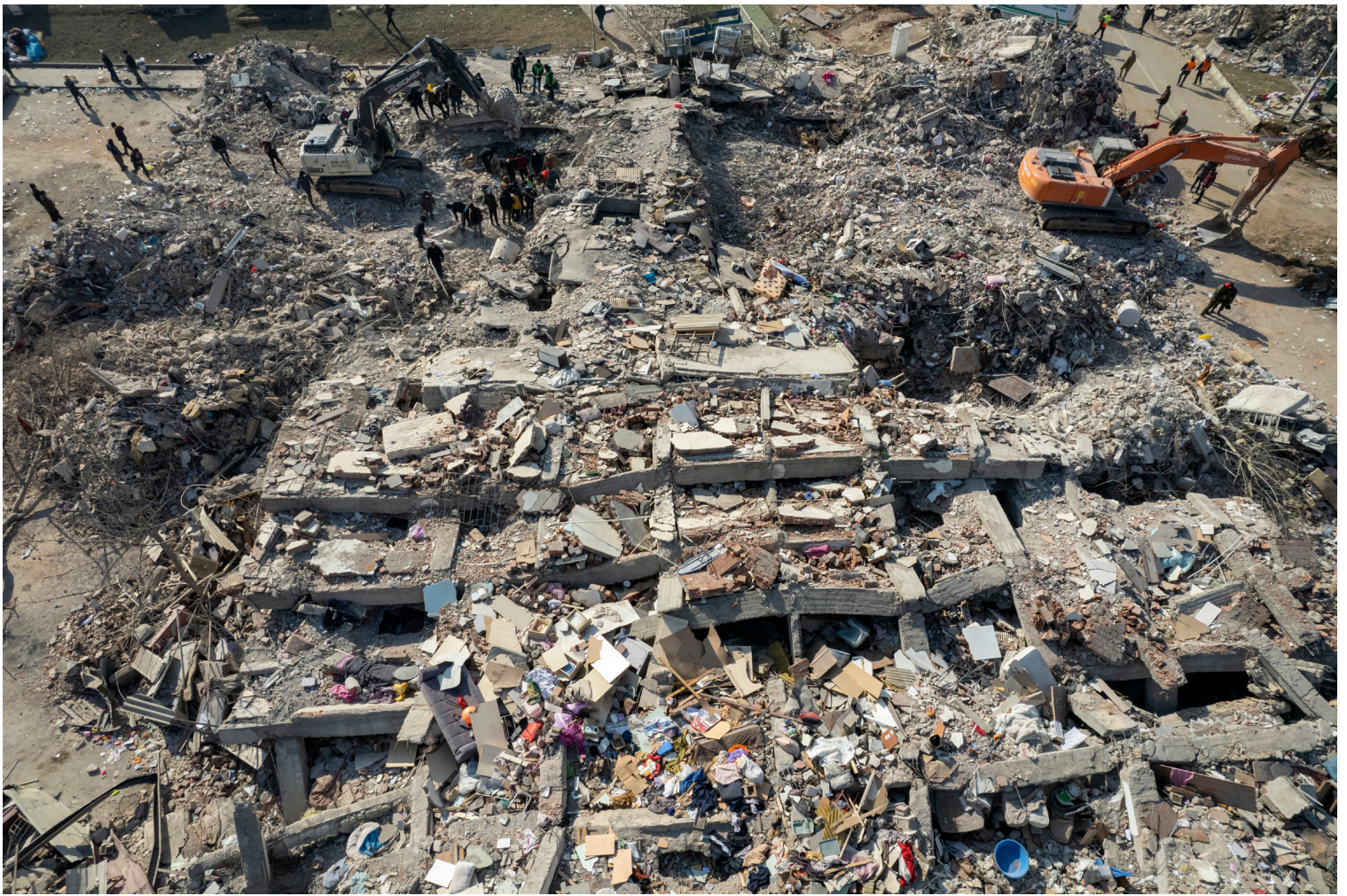
As a result of the earthquakes, one and a half million people across both Türkiye and Syria lost their homes.