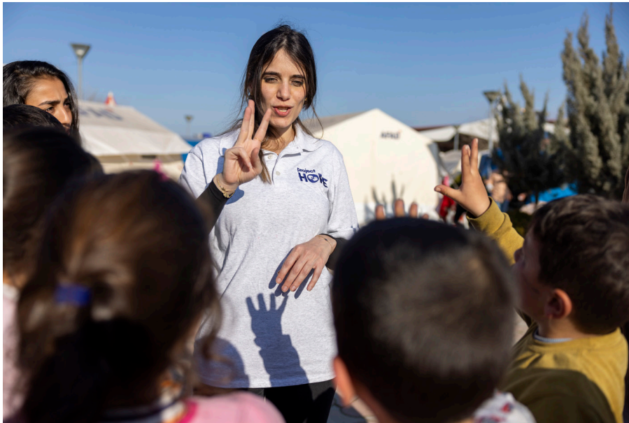
Project HOPE Mental Health and Psychosocial Support staff play with children in Nurdagi tent city during an assessment visit.

All seven informal camps need onsite medical provision—either through a static clinic or mobile medical unit—including health practitioners, containers or vehicles, and medication, equipment, and supplies. Each of these settlements also require secure transportation for patients with complex conditions to nearby health clinics.