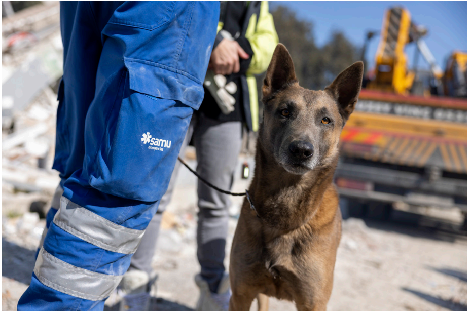
Project HOPE partner SAMU conducted search and rescue operations with a K-9 team in Antakya, Turkey on Friday, February 10, 2023. SAMU's Type 1 Emergency Medical Team is currently on standby in the event the WHO and Turkish government requests additional health support to earthquake-impacted areas.

The current situation, coupled with the likelihood that it will take months, if not years, for impacted communities to recover, means that there are significant needs for a coordinated, targeted, and robust intervention across several sectors, including health, mental health and protection services (MHPSS), non-food items (NFI), shelter, and water, sanitation, and hygiene (WASH).