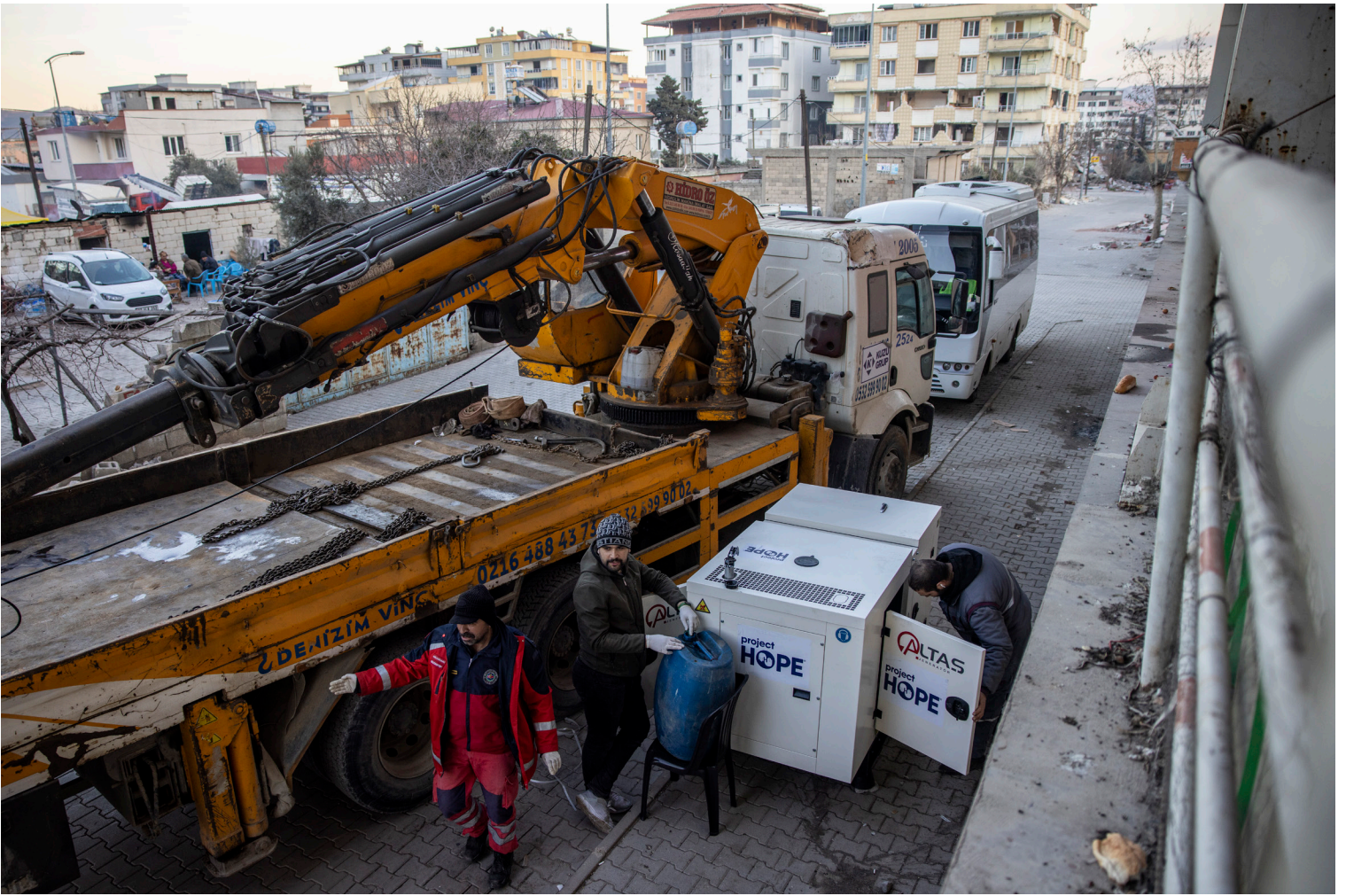
Project HOPE generators arrived within two weeks to the Ministry of Health for a local hospital in Gaziantep.